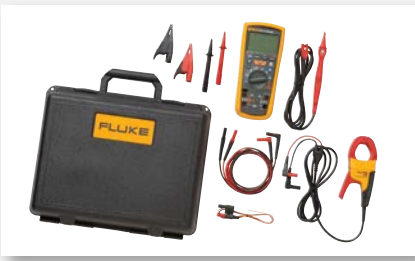
Fluke 1587 FC ET Advanced Electrical Troubleshooting Kit

Establishing preventative maintenance programs are becoming critical to maintaining the uptime of electrical equipment and can significantly reduce both planned and unplanned downtime. Unplanned downtime costs are difficult to calculate, but often significant. For some industries, it can represent 1 % to 3 % of revenue (potentially 30 % to 40 % of profits) annually.