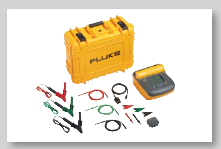
Fluke 1550C FC Insulation Resistance Tester Kit