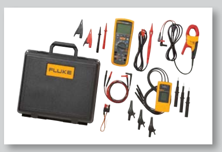
MDT Advanced Motor and Drive Troubleshooting Kit