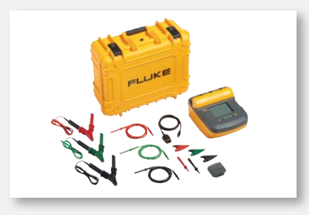
Fluke 1555 FC Insulation Resistance Tester Kit