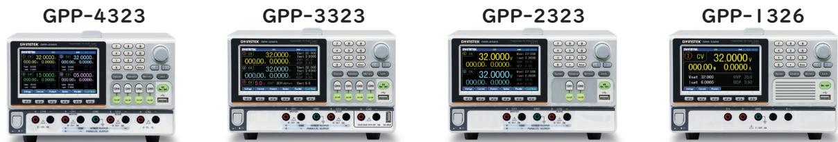
CH3: USB Type output terminal*

Low Ripple Noise: \leq 350\mu\text{Vrms} / \leq 2\text{mArms} Transient Response Time: \leq 50\mu\text{s}