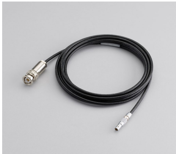
Figure 1: Model 4200-MTRX-X Triaxial Cable Assembly

The item shipped may vary from the item in the picture.