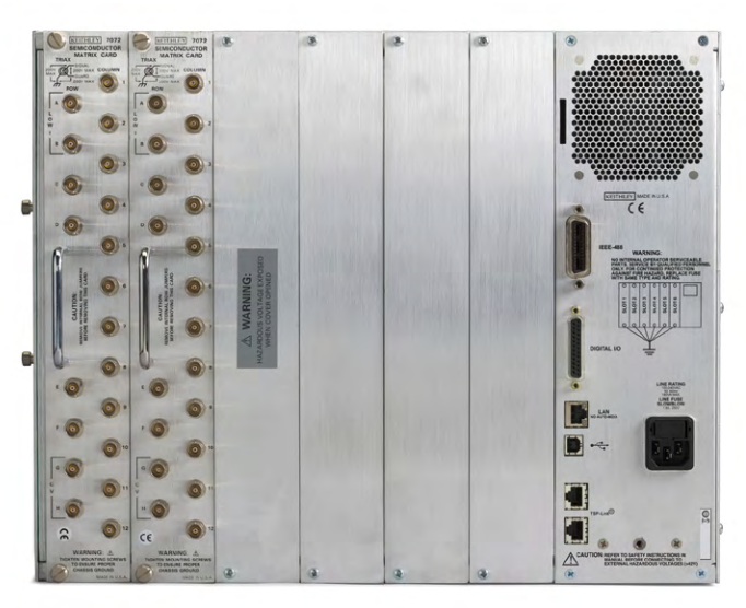
707B rear panel

Prefer to create your own customized application software? Native National Instruments Labview®, IVI-C, and IVI-COM drivers are available for downloading to simplify the programming process. For the Labview® driver please visit <a href="https://www.ni.com">www.ni.com</a>; for IVI drivers please visit <a href="https://www.tek.com">www.tek.com</a>.