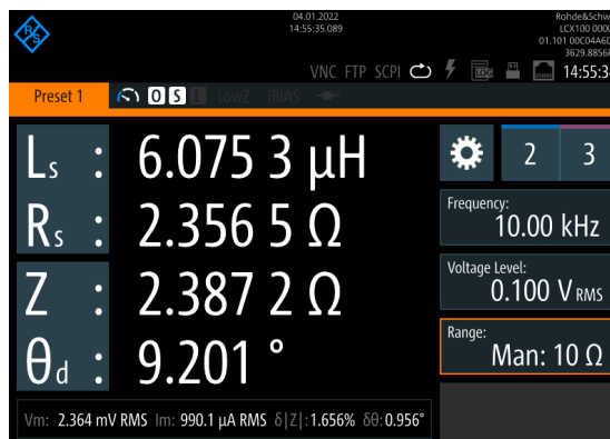
Leakage inductance measurement at 10 kHz and 100 mV (RMS)