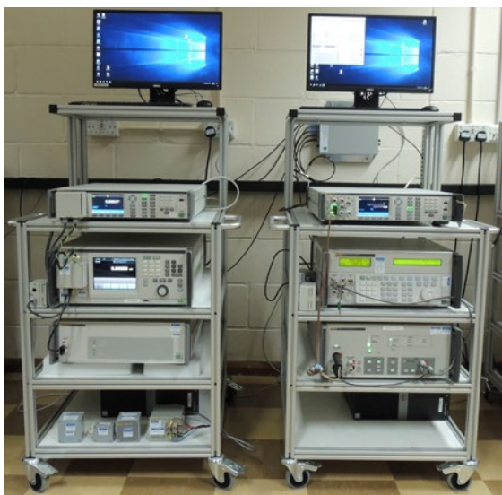
Factory Automated Calibration System.

If all the recommended points are tested, full verification of the 8588A requires approximately 600 points (fewer for the 8558A), around 2.5 times as many compared to 8508A. Despite the points count differences, the overall calibration adjustment and verification times for the 8588A and 8558A are similar to the 8508A. However, the number of essential 8588A and 8558A